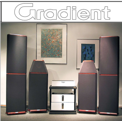
Gradient Revolution Active System with 2 SMART BASS modules per side

DSPeaker takes this further with their Anti-mode DSP technology which listens to how the room is corrupting the bass and pre-corrects it.